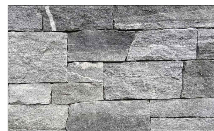
STONE VENEER- COLOR: COLORADO GREY