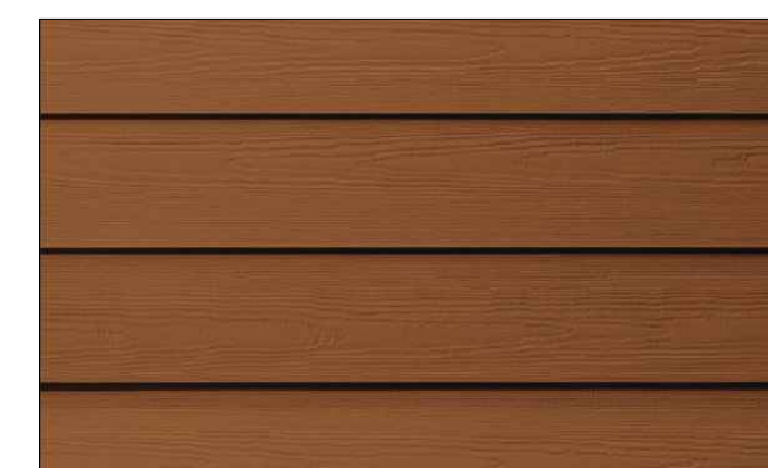
HARDIE SIDING / SOFFIT- COLOR: CEDAR